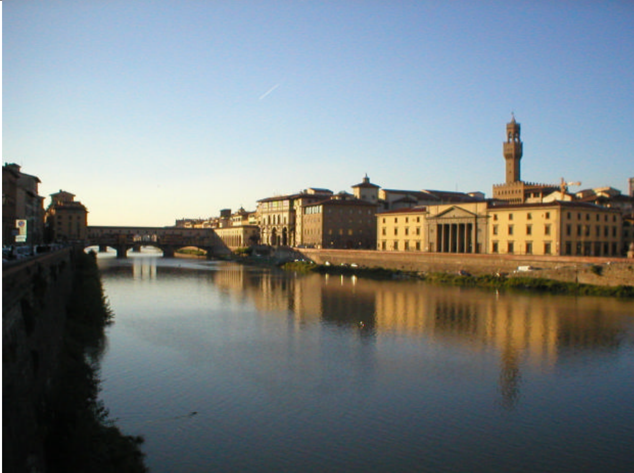
Arno River, Florence, 2002

Save the Date: Visiting Professor Dinner Thursday, October 23, 2003 At Maison Robert (Old City Hall) School Street, Boston