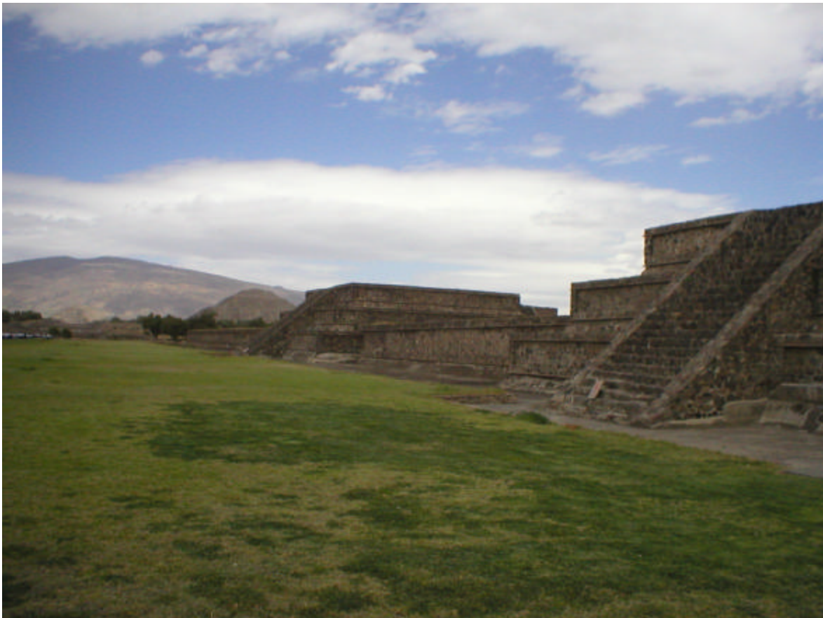
Teotihuacan Pyramids outside Mexico City