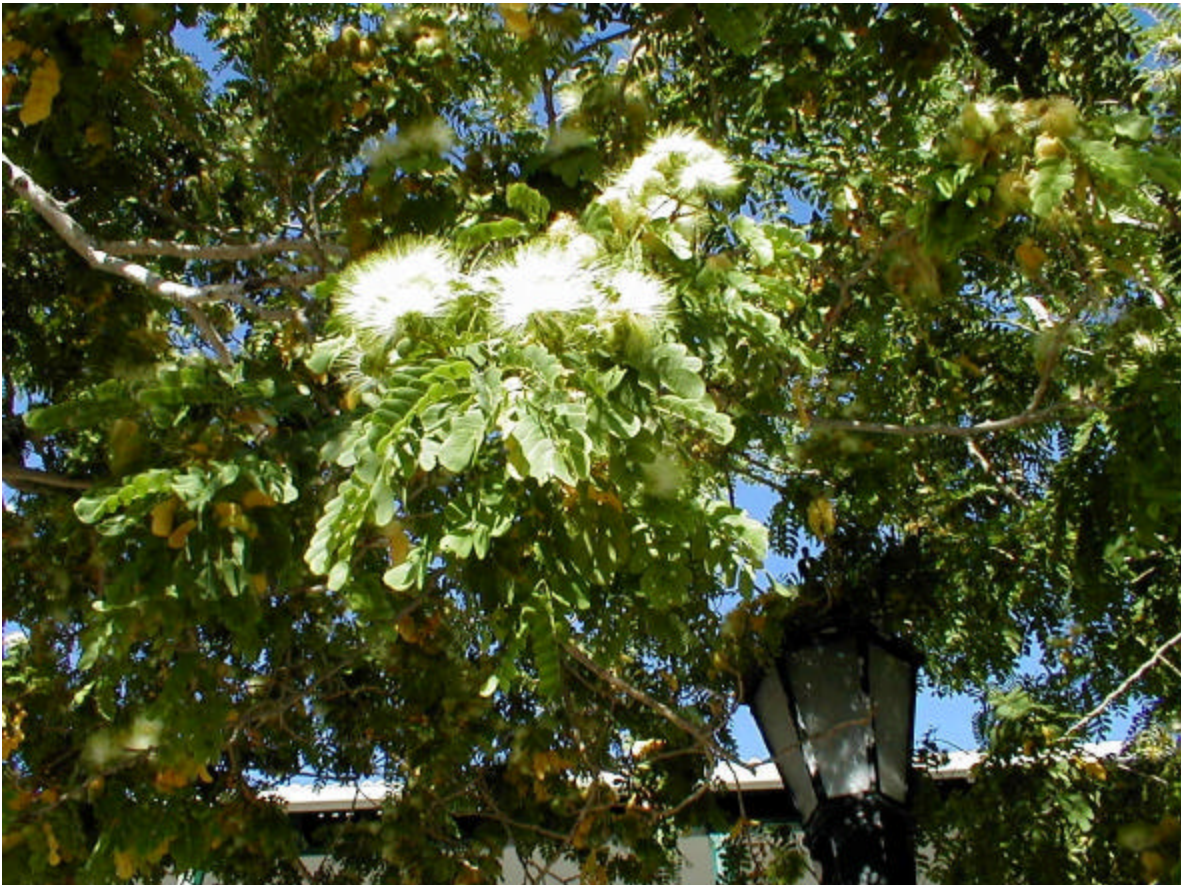
Flowering tree, Bermuda

Save the Date: Partners Asthma Center Dinner-Dance Thursday, September 22 Boston Marriott Hotel, Newton