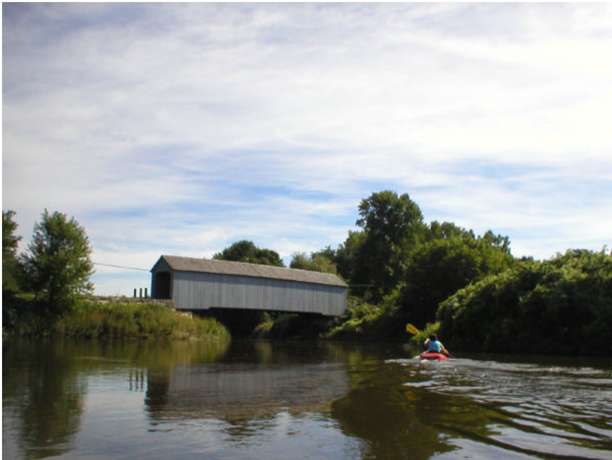
Covered Bridge over the Housatonic River, Sheffield, MA