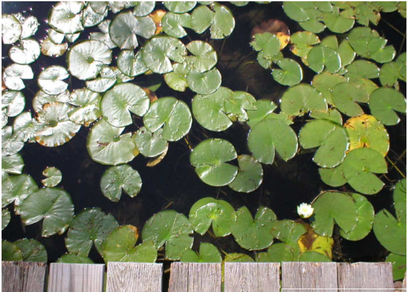
Water lilies, Summer, 2004